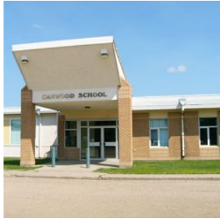
CANWOOD PUBLIC SCHOOL NEWSLETTER

850-1st Street East Box 370 Canwood, SK S0J 0K0